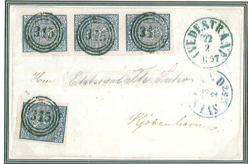
TO DENMARK - HIGHLIGHT OF THE EXHIBIT:

4 sk. 1855 - single copy and vertical strip of three = 16 sk. - each stamp with 3-circle cancellation "315" and "TVEDESTRAND 22-2-1857" (E). This entire letter sent to Copenhagen via "SVINESUND 28-2-1857". The rate for single letters (1852-60) was 17 sk. (Norwegian postage 5 2/3 sk. + sea rate 5 2/3 sk. + Danish postage 5 2/3 sk.) to Denmark via Sweden (underfranked by 1 skilling - 3 skilling stamps didn't come into use before June 1857). The addressee has been replaced by pencil, but this item is the most beautiful entire letter to Denmark.