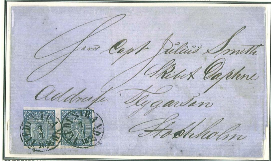
“TVEDESTRAND 7-7-1856”(E). This mark was in regular use on stamps in 1856. 8 sk. was the postage rate for letters up to 1 lod to Sweden from January 1st 1855 to January 1st 1860 (stamps to Sweden were allowed July 1st 1855). According to Wasenden (1994), this is the only letter to Sweden from Agder with Norway number one, but there are three other items known (two of these in this exhibit (see Arendal and Farsund Postexpedition in part C.2)).